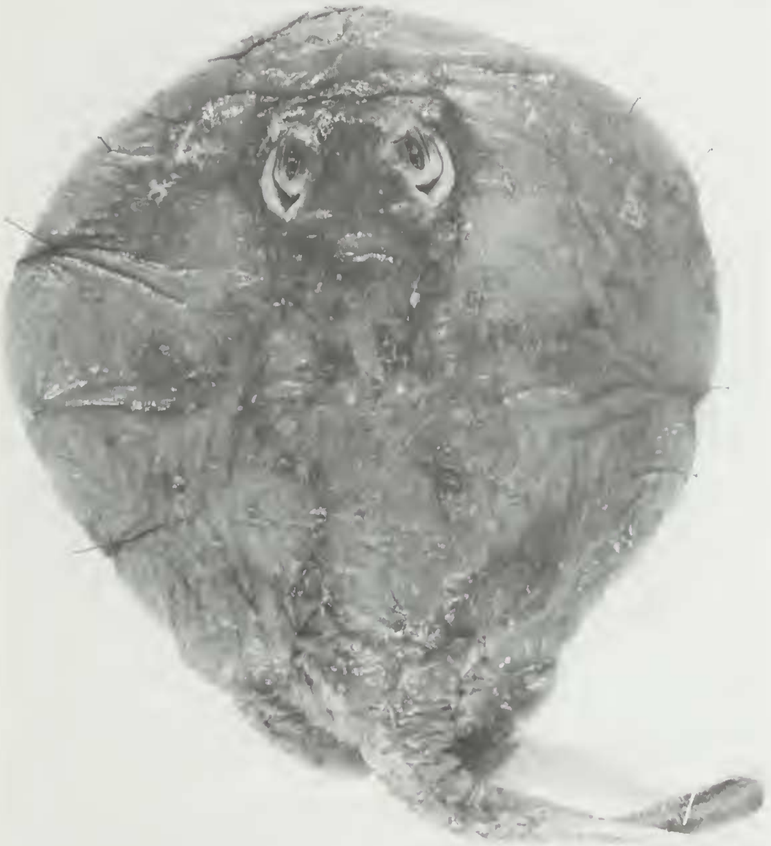
Figure 3. Urolophus orarius , holotype, AMS I.20194-043.

lobe. Posterolateral border of nostril forming weak knob, not forming broad flattened lobe. Tail rounded in cross-section; moderately elongate (72-80% disc length); lateral cutaneous folds and